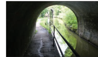
The 176-yard Woodley Tunnel is followed by the canal tow-path.