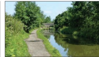
The Peak Forest canal opened in 1796 and runs for 15 miles from Ashton-under-Lyne to Whaley Bridge in Derbyshire.