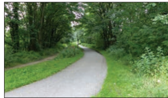
The disused railway between Apethorn and Godley is followed by the Trans-Pennine Trail and part of the National Cycle Network route 62.

1 From the entrance on the main road, turn right and immediately right again over a stile into a wooded valley. 2 Descend to the stream, cross and climb up the other side. Bear right and walk up the side of the valley, keeping just inside the woodland edge. 3 On emerging from the trees walk up to Bowlacre Farm and take a narrow path straight on between wall and hedge. 4 Cross the next field to a kissing gate behind a lone alder tree. 5 Bear right and walk up the right-hand side of the next two fields to a track. 6 Turn right (signposted Woodley) and follow the track along the contour, ignoring the uphill track through the