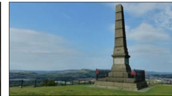
Hyde War memorial was erected in 1921 to commemorate the sacrifice of 710 local men in World War 1. It forms the centrepiece of Werneth Low Country Park and offers wide views over Manchester and beyond.